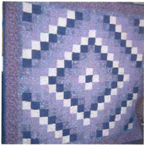
Item # 1 Butterfly quilt 72 x 72

Mail tickets and check to: Compassionate Friends-Quakertown Chapter PO Box 1013 -- Quakertown PA 18951