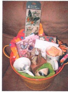
Item # 3 gift basket of butterfly items