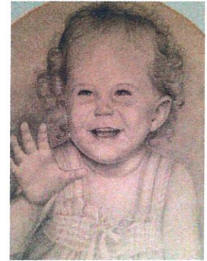
Item #5 Portrait done in pencil from your favorite photo of your loved one by artist -Linda Stauffer